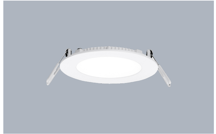
Slim-Fit™ 6W IP44 Round Low Profile LED Downlight